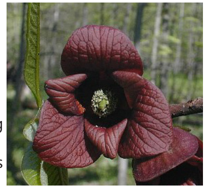
The deep burgundy color of a Paw Paw flower.

Spring wildflowers with a deep burgundy color are best for attracting carrion beetles, fungus gnats, ants, and scavenging flies. Many of these flowers also have a faint scent of foul-smelling meat to add an extra layer of allure. The deep red color and putrid odor resemble decaying meat. By enticing beetles and flies to help them reproduce, these plants avoid having to compete for more popular pollinators. Skunk Cabbage, Paw Paw, Prairie Trillium, Jack-in-the-Pulpit, and Wild Ginger are examples of plants with this pollination tactic.