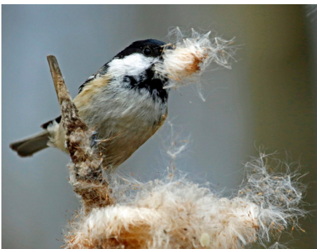
Black-capped Chickadee collecting Cattail Fluff

Place yard clippings like grass, twigs, and plant stems in piles near brush cover. The birds can collect your yard waste, and hide from predators between trips.