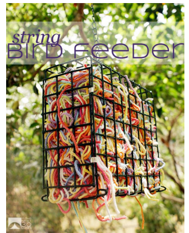
Example of a string bird feeder found on Pinterest

Woven yarn, string, thread, and even human hair have high tensile strength. This is valuable to us when making clothing and tying things up, but wildlife can get tangled and be unable to free themselves. Tightly twisted string can cut into wings or feet, causing infections and impeding movement.