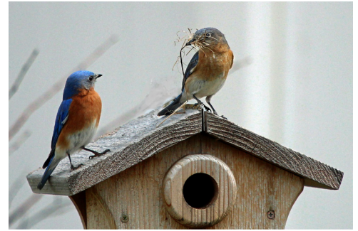
Male (L) and Female (R) Eastern bluebirds on a nesting box carrying natural nesting materials

Hope you get to watch the birds build safe and warm homes for their eggs throughout this spring!